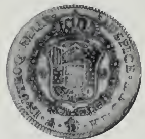
Lot No. 2385